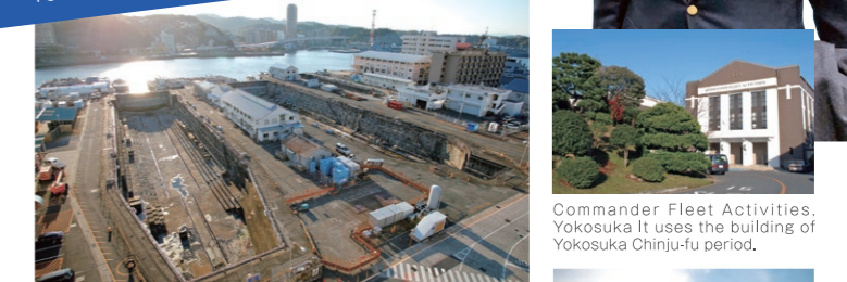
There remains precious heritage of modernization such as the dry dock built in Meiji through Showa era.