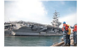
Aircraft Carrier USS Ronald Regan sailing into Yokosuka Naval Base leading crew of over 5,000 members.

US-Japan Spring Festival (late March or late April) Yokosuka Friendship Day (early August) Yokosuka Mikoshi Parade (October) US-Japan Historical Tour (twice in spring and twice in autumn)