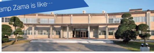
Building of Headquarters US Army Japan-So called "Little Pentagon"