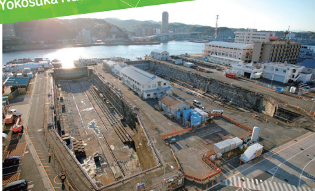
There remains precious heritage of modernization such as the dry docl built in Meiji through Showa era.